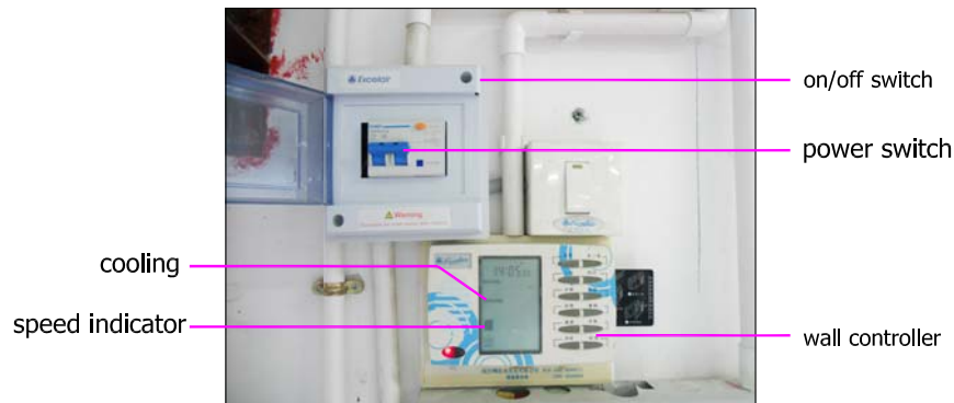
Pic 4 , power on , turn on machine and switch to cooling status , and turn to low speed segment .

Step 2 , Check the working status of UV Sterilization System