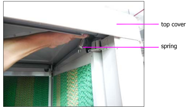
Pic 2 , remover the top cover