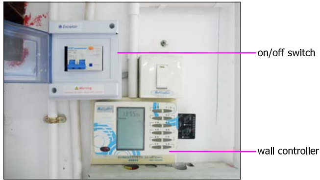
Pic 1 , cut off power source for ventilator

Step 1 , Remove the top cover of ventilator